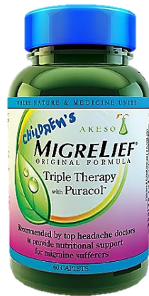
*Children's MigreLief Age 2 - Adult