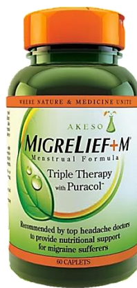
*MigreLief +M Menstrual Migraines