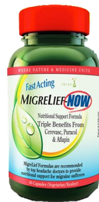
MigreLief-NOW Age 2 - Adult